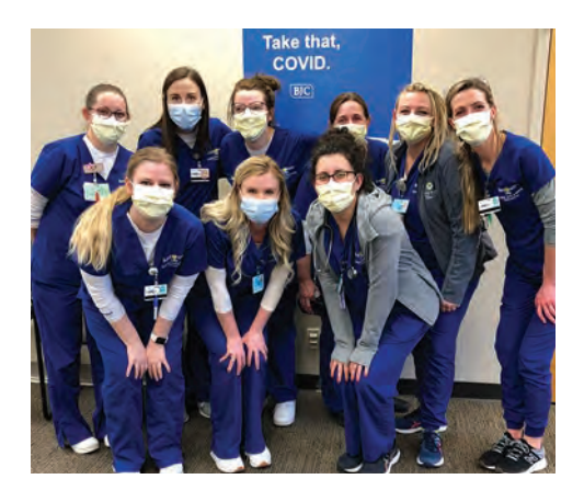
GOLDFARB STUDENTS WORKING AT A VACCINE CLINIC IN 2021.